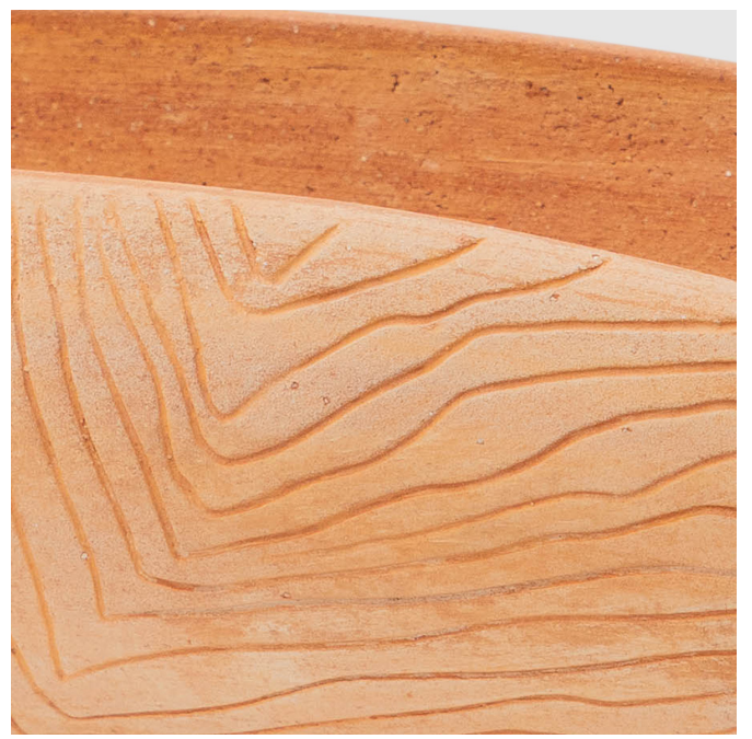
A simple, patterned vessel measuring around 600 millimetres in length, based on a bark coolamon and water carrier. A versatile piece – use it as display or on a tabletop – that celebrates the beauty and sophistication embedded within First Nations design.