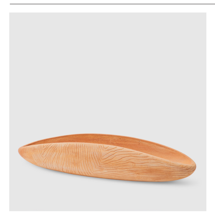
Earth Wirri takes its inspiration from bark coolamons, water carriers and other expertly crafted tools and utensils born of country over generations.